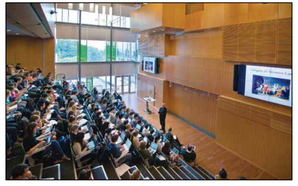
UBC students in a classroom.