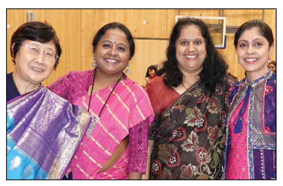
UNA residents share the joy and beauty of the first ever Diwali Festival at the Wesbrook Community Centre on Saturday, November 3. Please see story on Page 5.