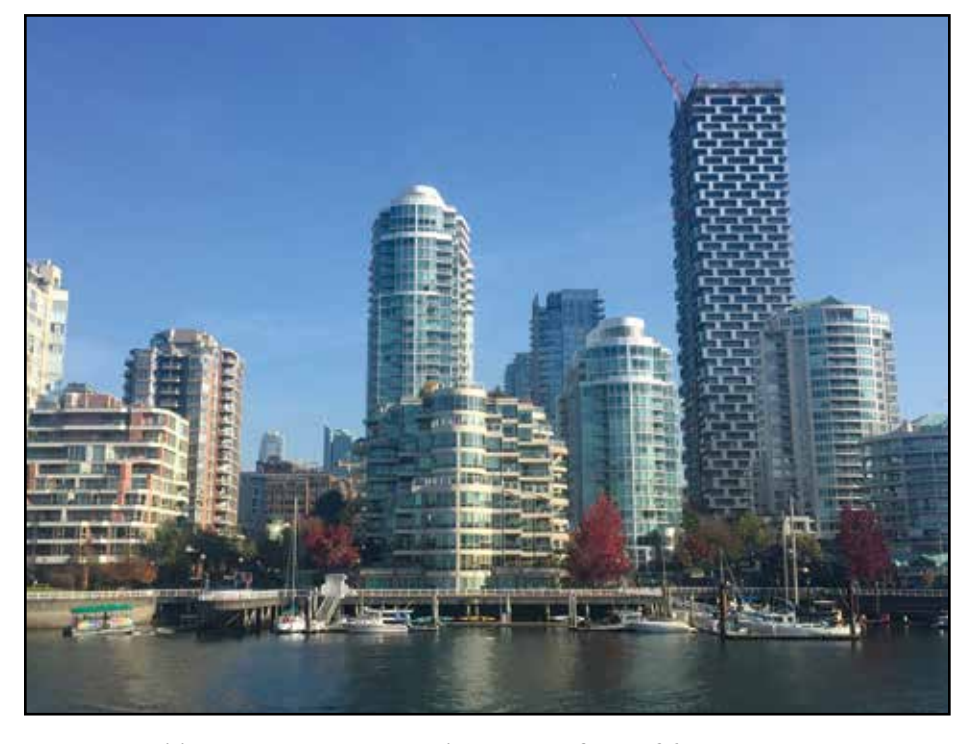
Petitioners say that constructing towers of up to 36 storeys may be appropriate in Yaletown Vancouver, but they are out of character for the UBC campus and will reduce quality of life.

We can do better than this! UBC is full of smart creative people and we can do a much better job of designing a sustainable community that fosters connection to neighbours and nature, walking and biking, cafes and gardens, and true participatory planning that honestly engages the people who will live in these communities. Let's build something that will still make us proud 50 years from now! Jeanine