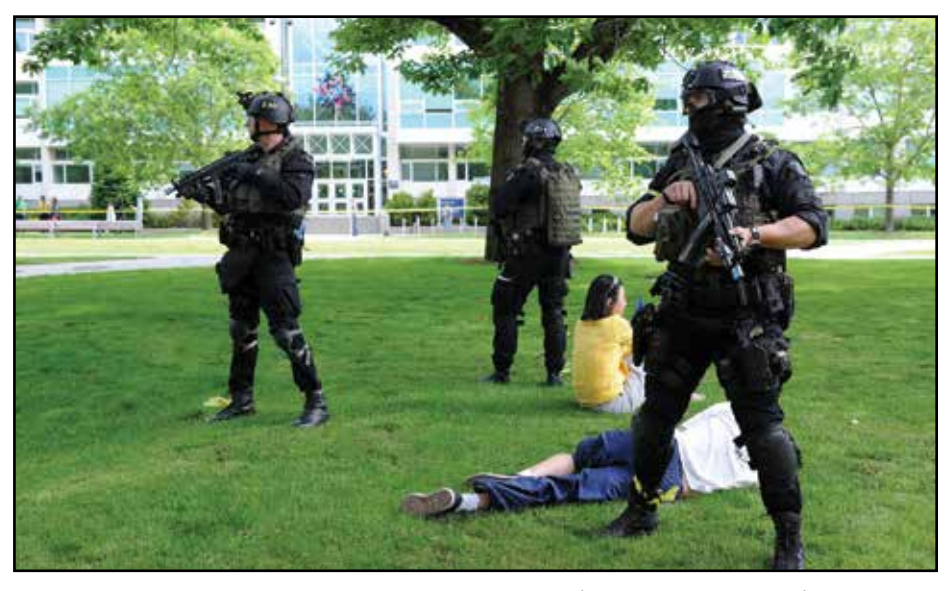
Emergency Response Team members during emergency exercise on UBC Vancouver campus.