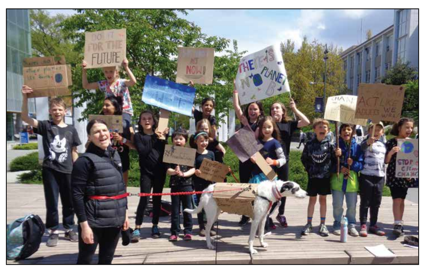
University Hill Elementary School students and some parents demonstrate in front of the Robert H. Lee Alumni Centre at UBC during the climate strike on school day Friday, May 3.